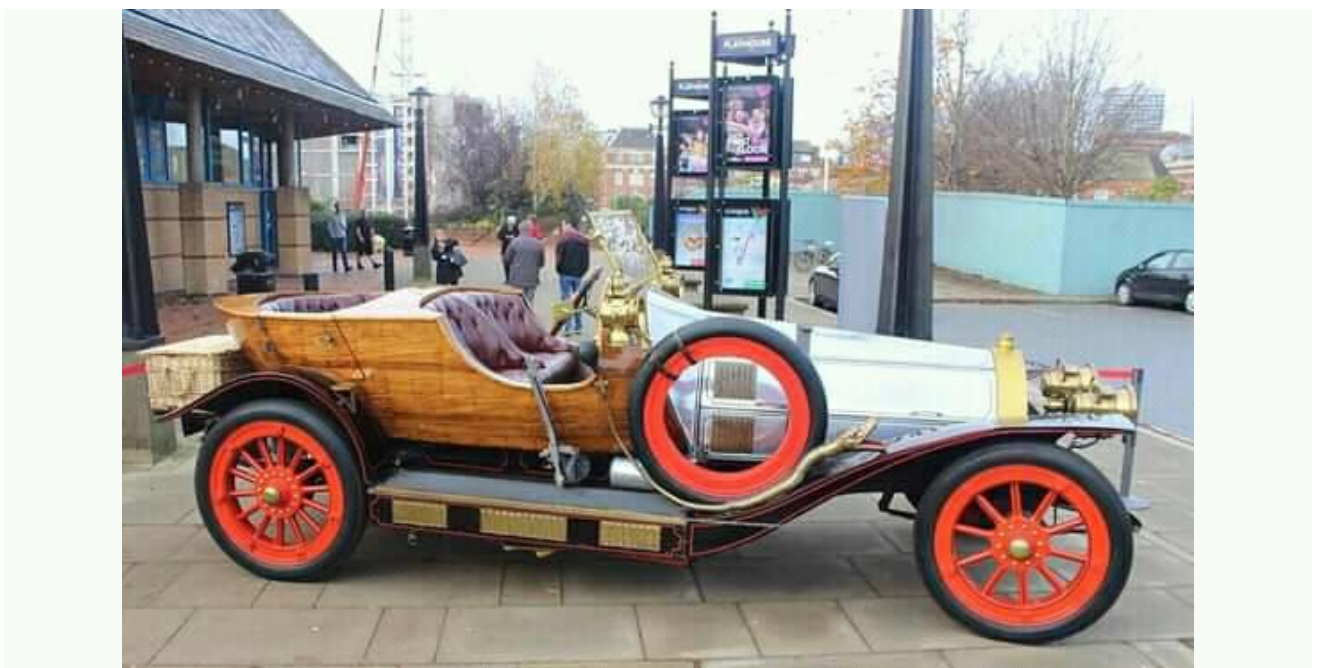
Vintage Automobiles & Rare Vehicles

Chitty Chitty Bang Bang is the vintage racing car which is featured in the book, musical film and stage production of the same name. Writer Ian Fleming took his inspiration for the car from a series of aero-engined racing cars built by Count Louis Zborowski in the early 1920s, christened Chitty Bang Bang. The original Chitty Bang Bang's engine was from a Zeppelin dirigible. The name reputedly derived either from the sound it made whilst idling, or from a bawdy song from World War I. Six versions of the car were built for the film and a number of replicas have subsequently been produced. The version built for the stage production holds the record for the most expensive stage prop ever used.